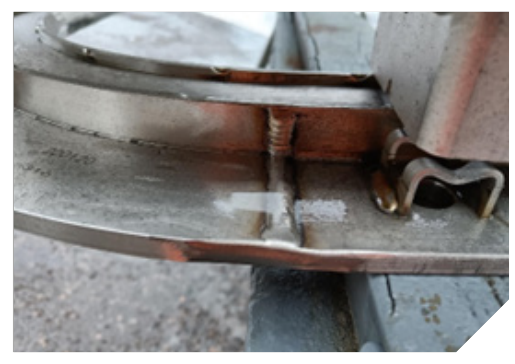
Hand welded seam

The laser welding technique is more advanced, resulting in a visually different result. The welding seam is clean and there is no need for post machining.